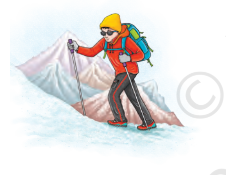
Fig. 11.7: Trekking

Camping gives students a good break, away from the monotony of the classroom. It gives an opportunity to learn from nature in a joyful, exciting and adventurous manner. Living in the natural environment with students from different areas, cultures, religions and backgrounds, help then to learn to work as a team in various activities. These activities differ from adventurous and challenging ones, to the most basic ones, such as, cooking, cleaning, collecting water, etc. In this process, students learn the importance of self-reliance, teamwork, co-existence, importance of natural resources and organisational skills. Camping also offers great opportunities for empowerment of the girls.