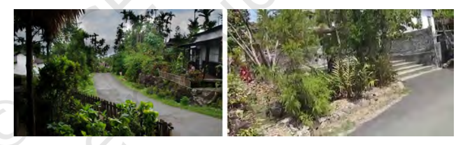
Fig. 11.1: Mawlynnong Village

India Magazine. It is about 75 km away from Shillong, the capital of Meghalaya. Most of the houses in this village are beautifully decorated with flowers and plants. As per the Census of 2011, the total population of Mawlynnong is 414. The main occupation of the villagers is agriculture, but it has also been an age old tradition of ensuring that the surrounding environment is clean. In fact cleanliness is a collective effort and this practice is ingrained in the people since their childhood. The people voluntarily sweep the roads and lanes, water the plants in public areas and clean the drains. A dustbin made out of bamboo is found all along the village. Everyone makes it a point that dirt and waste are not thrown anywhere. All the waste from the dustbin is collected and kept in a pit, which the villagers use as manure. Trees are planted to restore and maintain nature's balance. Mawlynnong's fame as the cleanest village in Asia, is drawing a lot of domestic as well as international tourists, as a result of which tourism is also an important source of employment for the local youths. Besides, there are many interesting sights to see such as the famous living root bridge in the nearby village of Riwai, which is a fascinating example of indigenous methods of conservation and sustainability. Local youths are available as enthusiastic and informative guides.