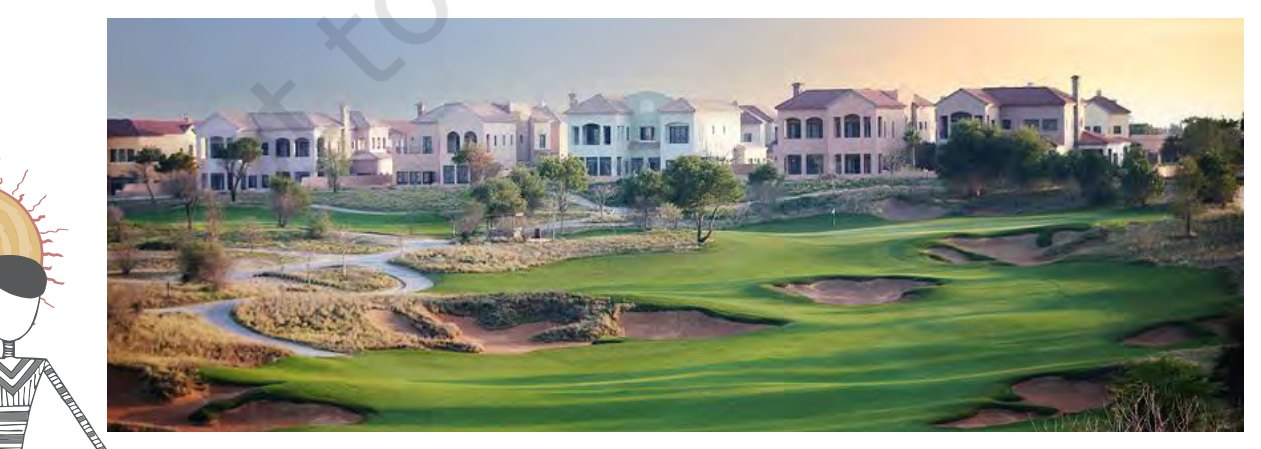
Fig. 11.2: A modern township