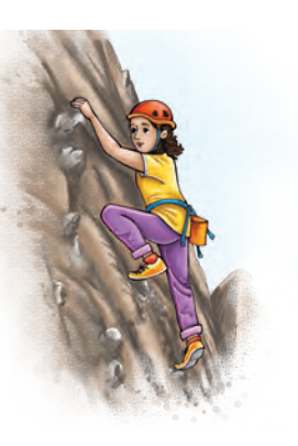
Fig. 11.9: Rock climbing

While camping, one can engage in adventure sport, such as, trekking, river rafting, mountaineering, rock climbing, repelling, paragliding, caving. Adventure sport help to develop courage, self-confidence, leadership qualities and enhance concentration powers. This is also a great form of physical exercise. However, these activities should be conducted only in the presence of qualified and professional trainers. Joining the National Cadet Corps (NCC), National Service Scheme (NSS) or Bharat Scouts and Guides will also give you opportunities to take part in these activities.