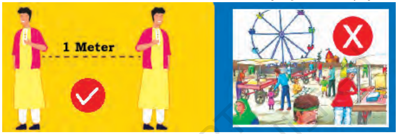
Fig. 11.4: Social distancing dos and don'ts