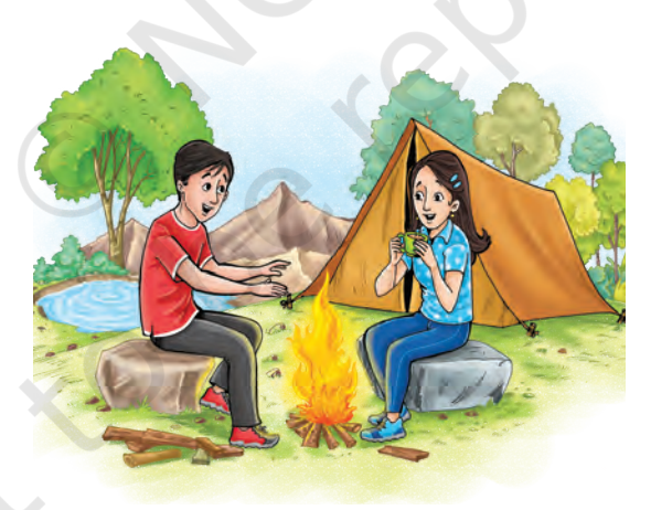
Fig. 11.6: Camping

Youngsters might have already attended a camp or may have heard about camping activities from friends. Camping is an outdoor activity, where familiar surroundings are left to spend a night or several nights at an outdoor site. The location of these sites varies as per the objectives of the trip, time of the year and budget available.